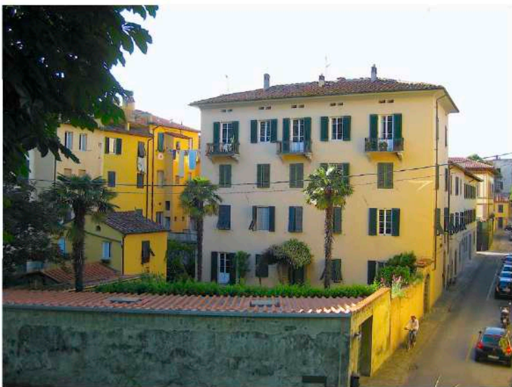
Top left: Gemma Galgani. Top Right: The Galgani house in Lucca.