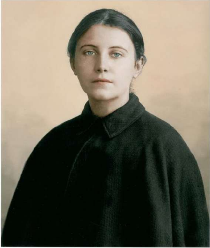
St. Gemma Galgani Pray for us