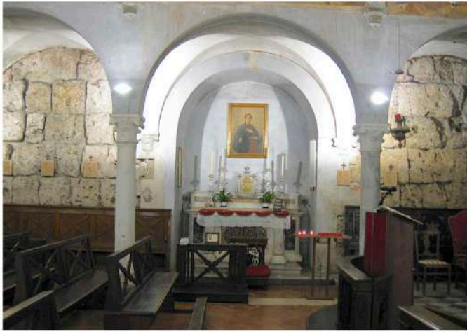
Top: Shrine of St. Gemma Galgani (Santa Maria de Rosa Church)