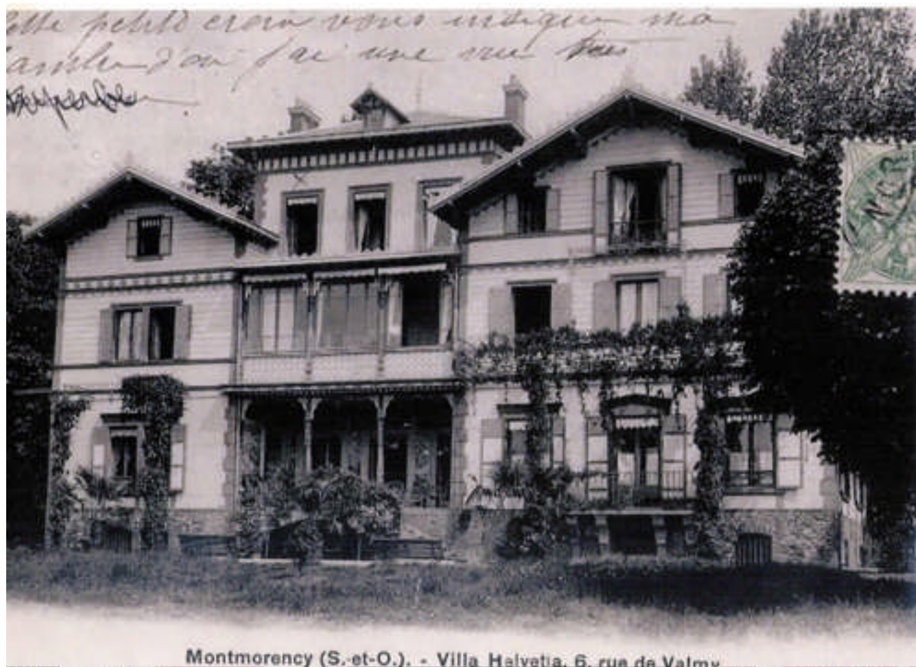
Villa Helvetia, Montmorency