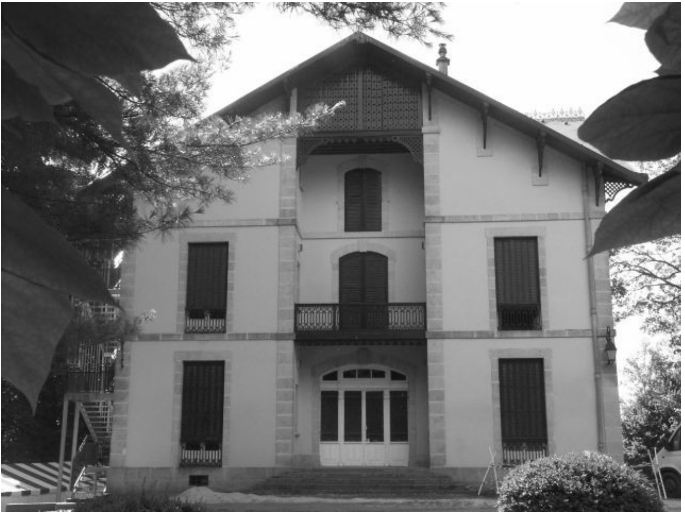
Le Couret, 2004