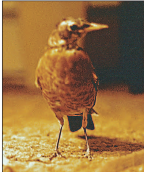
Byrd molting his head feathers. Approximately 1993.

I needed the strength to change. From Byrd's example, I drew inspiration.