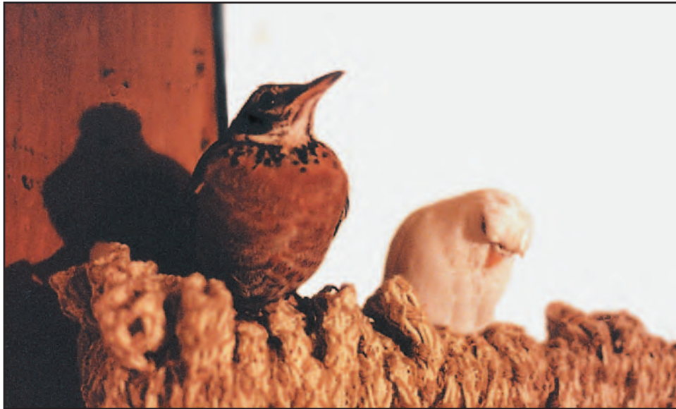
Byrd and Pinky settle on the curtain rod. Photo taken in early 1992.

The employment that provided financial relief subtracted from my time with Byrd. I tried to make up for it by adding another bird to our family.