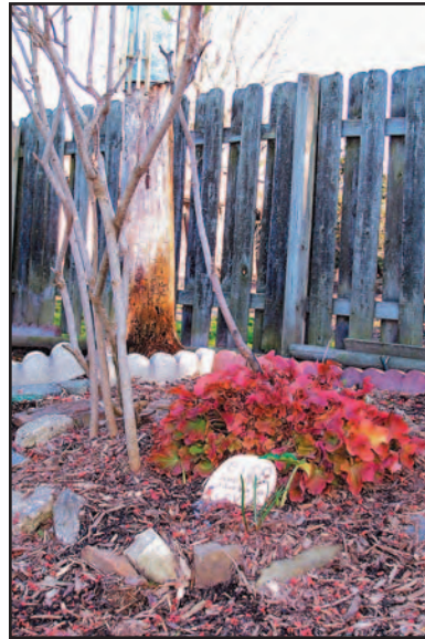
Full view of Byrd's grave. April 2011.

Byrd had to be buried, but I could not let him go. I had to see him, touch him, talk to him, pretend that he was still alive. If I didn't pretend, I felt like I would lose my mind. Hour after hour, if I wasn't already crying, I was on the very border of it, waiting for a thought that would drive me to my knees. I fought back tears during work days, not wanting anyone to question what they could not understand. Upon my daily return to the apartment, I rushed to Byrd's open cage to find his body exactly as I had left it: leaning against the side of the cage, next to his food bowl, as if in a deep sleep. I petted him as if he actually was in a deep sleep, and repeated "I love you, Byrd. I love you so much." Somehow, his body comforted me a bit. I didn't know what to make of that feeling. Was it morbid? Sick? Insane?