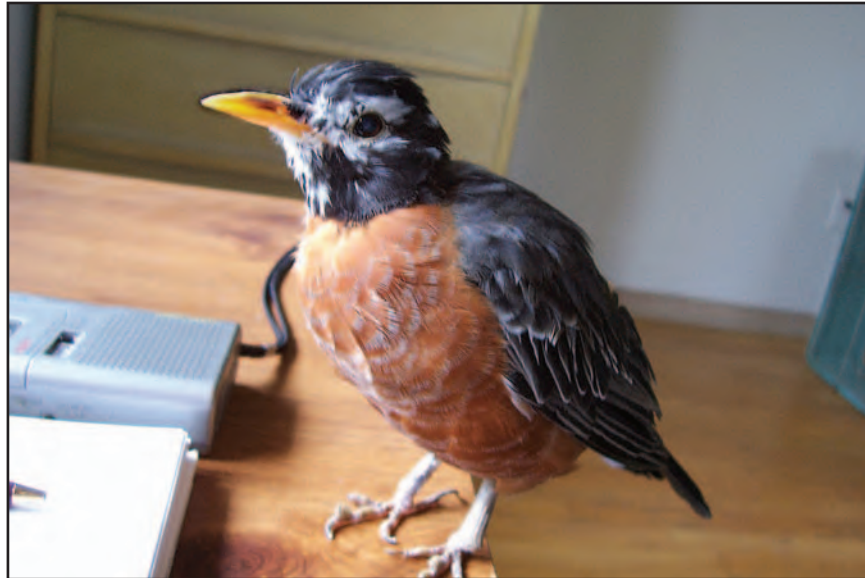
Byrd at 16 years. Although this photo shows white facial feathers, Byrd molted them to retain his normal coloring throughout his life. 2008.

Over the next few years, Byrd's typical day did not change much. He couldn't fly to the perches in his cage, so he settled for nestling on the floor newspaper, which I kept clean and dry. Byrd's cage door remained open. Very infrequently did he throw himself into flight. When he did, he fluttered a few feet, hovering until his claws settled upon the carpet. Sometimes, Byrd cackled the entire way down—"bababababababab"—complaining about how the world had become so opaque. After settling, he'd turn to find my shadow and then fine tune the angle of his head to listen for the details of my whereabouts.