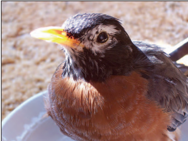
Beginning a bath. Photo taken in 2004.

I can't help but to believe that Byrdie liked to do tricks. Patience and a step-by-step process yielded wonderful results. Besides, he was a little show-off.