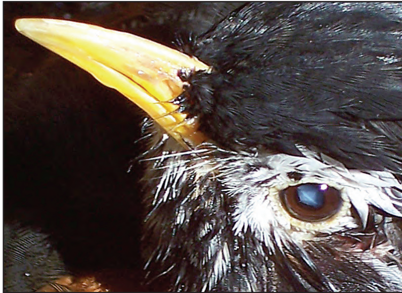
Byrd's eye. Photo taken 2004.

I remember the day that Byrd became old. The years following were difficult for both of us. I needed to return to that Ravenna sidewalk and find Byrd again.