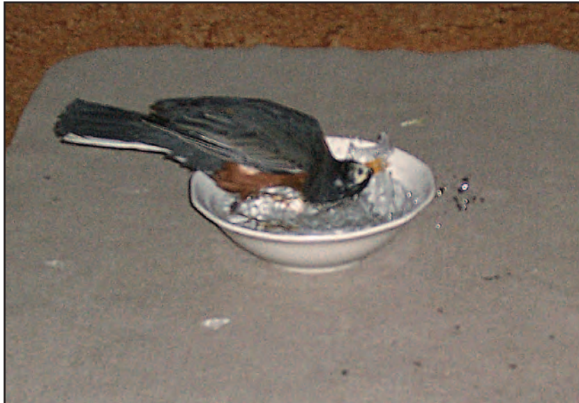
Byrd enjoying a bath. Photo taken in 2004.

From the day he entered my home, Byrd's curiosity freed him from the restraints of his box. Very few of my best memories involve Byrd in his cage. His life was one of discovery, companionship and the love that results.