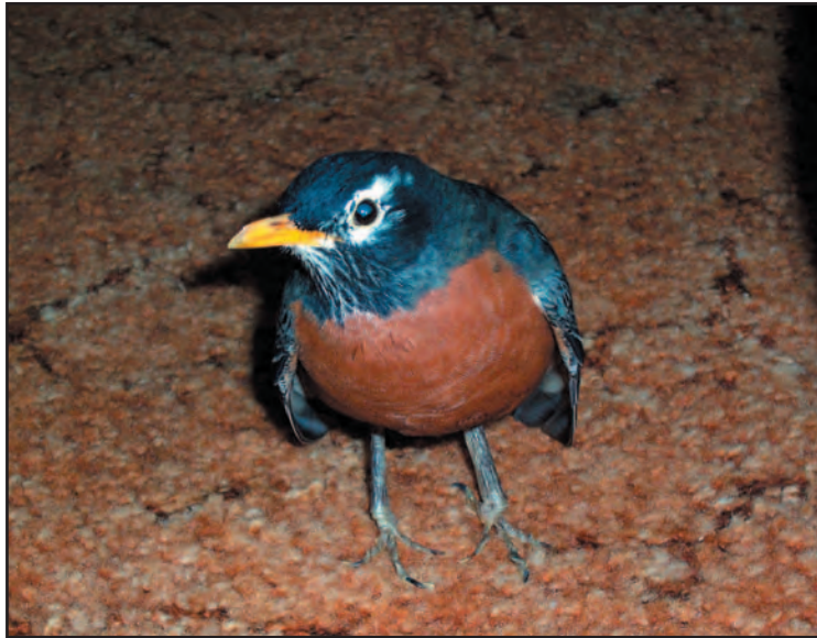
Never afraid of the camera, Byrd pauses for a photo in late 2004.

I vividly recall—probably too vividly—the times that I hurt Byrd. I still feel the regret that accompanies thoughtlessness, impatience, and the worst of all: neglect.