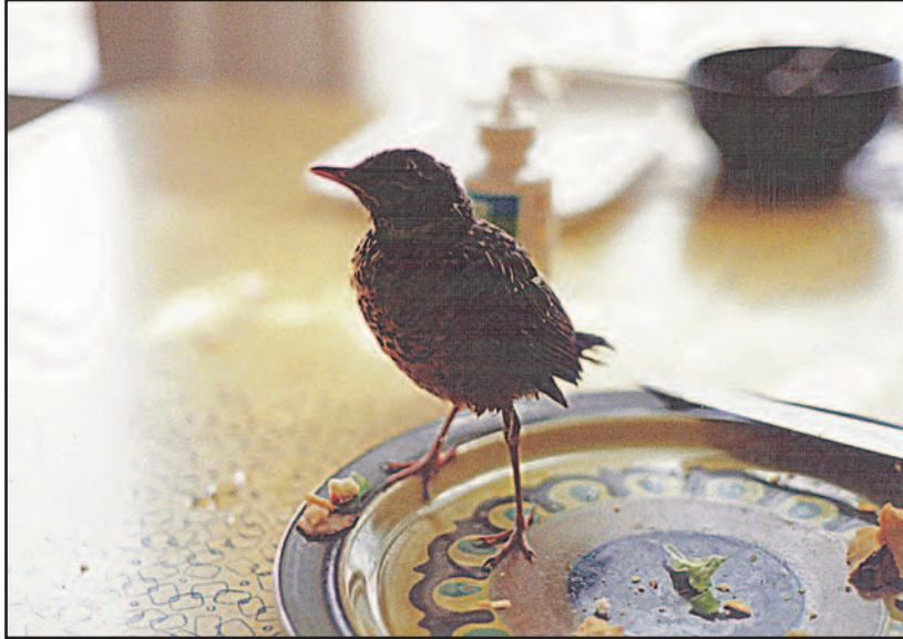
Taken at my kitchen table, this is one of only two baby pictures—a bad exposure on a film camera.

As much as I doubted myself and my abilities, I couldn't fail the little bird—that would lead to his death. Somehow, he knew my determination, and trusted me.