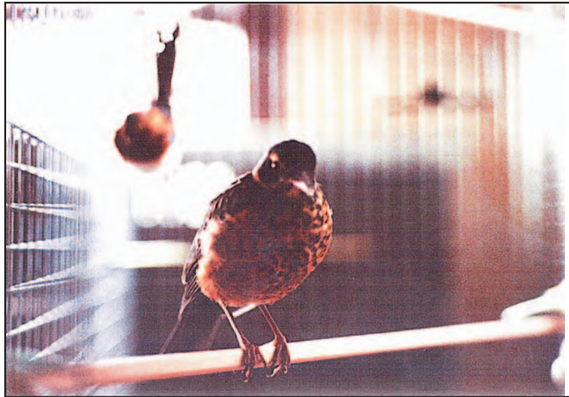
Byrd in his cage. Film photo taken in fall 1991.

Byrd quickly adjusted to his surroundings. As I guided him through a new world, he guided me to a new world: a world of hope.