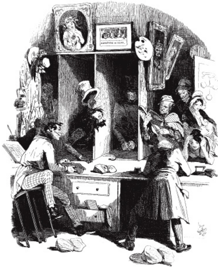
Martin meets an acquaintance at the house of a mutual relation

The shopman was so highly entertained by this piece of humour, that Mr Tigg himself could not repress some little show of exultation. It vented itself, in part, in a desire to see how the occupant of the next box received his pleasantry; to ascertain which, he glanced round the partition, and immediately, by the gaslight, recognised Martin.