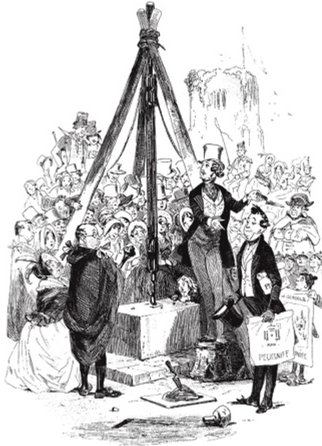
Martin is much gratified by an imposing ceremony

In short, Mr Pecksniff was supposed to have done a great work, and was very kindly, courteously, and generously rewarded. When the procession moved away, and Martin and Mark were left almost alone upon the ground, his merits and a desire to acknowledge them formed the common topic. He was only second to the Gentlemanly member.