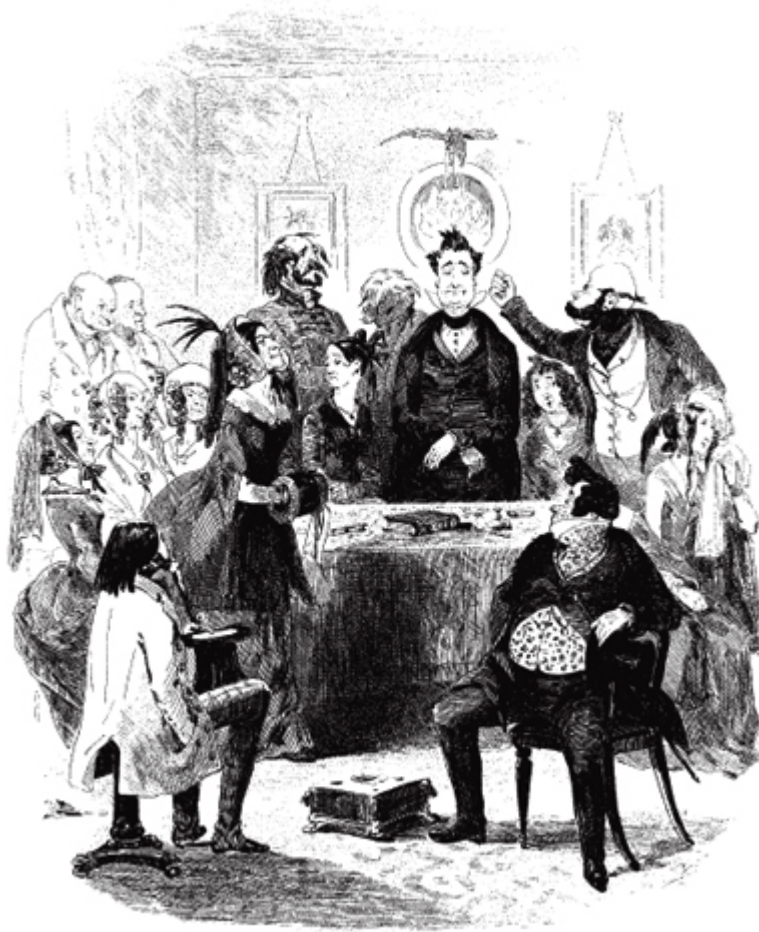
Pleasant little family party at Mr Pecksniff's

'This,' said Mr Pecksniff rising, and looking round upon them, with folded hands, 'does me good. It does my daughters good. We thank you for assembling here. We are grateful to you with our whole hearts. It is a blessed distinction that you have conferred upon us, and believe me' – it is impossible to conceive how he smiled here – 'we shall not easily forget it.'