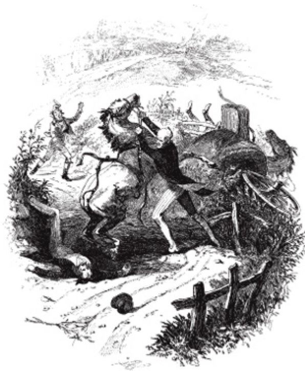
Mr Jonas exhibits his presence of mind

Jonas replied by advising him with a curse to hold his tongue, and to go somewhere, whither he was not very likely to go of his own accord. But Montague, who had listened eagerly, to every word, himself diverted the subject, by exclaiming: 'Where's the boy!'