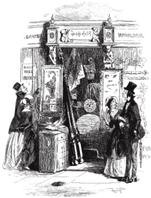
Mr Moddle is led to the contemplation of his destiny

Miss Pecksniff was quite gracious to Miss Pinch in this triumphant introduction; exceedingly gracious. She was more than gracious; she was kind and cordial. Whether the recollection of the old service Tom had rendered her in knocking Mr Jonas on the head, had wrought this change in her opinions; or whether her separation from her parent had reconciled her to all human-kind, or to all that increasing portion of human-kind which was not friendly to him; or whether the delight of having some new female acquaintance to whom to communicate her interesting prospects, was paramount to every other consideration; cordial and kind Miss Pecksniff was. And twice Miss Pecksniff kissed Miss Pinch upon the cheek.