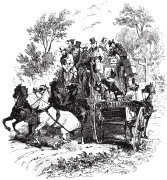
Mr Pinch departs to seek his fortune

‘Well! It’s a pleasure to you, I know,’ said Tom, squeezing her hand heartily. ‘Is there any news?’