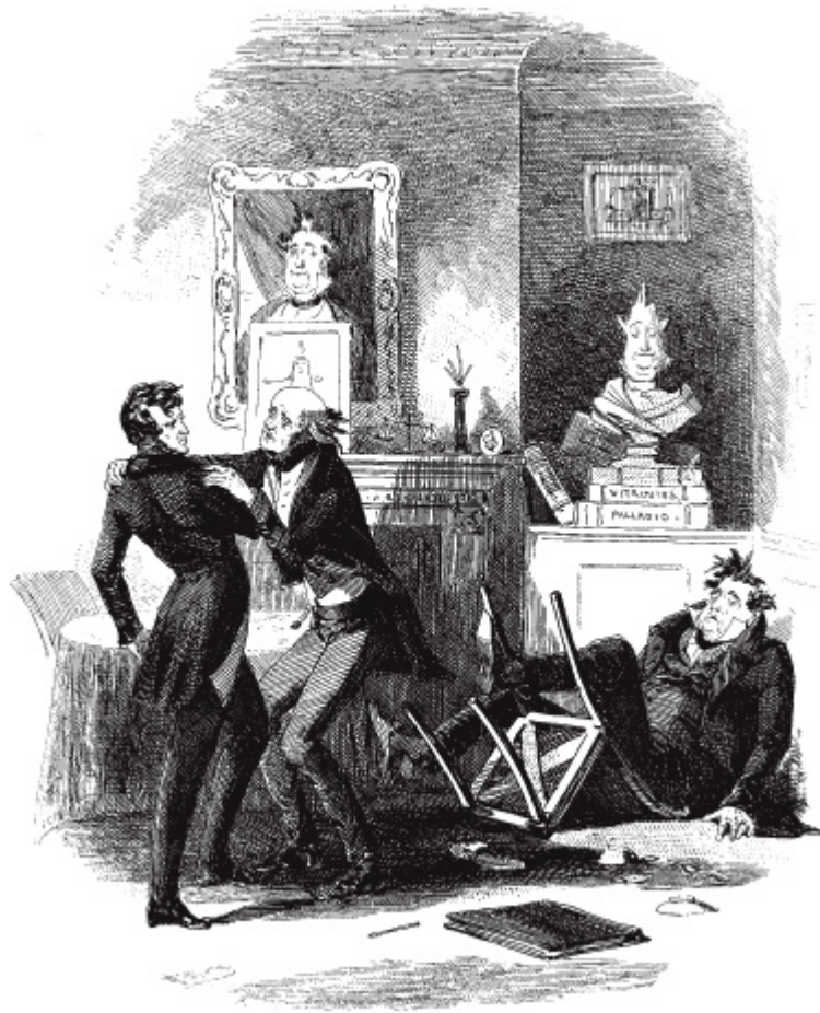
Mr Pecksniff renounces the deceiver

'Well! what now?' he said, when Tom came up.