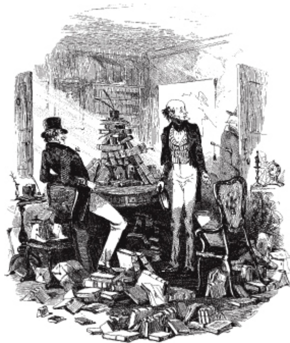
Mysterious Installation of Mr Pinch

‘But why in his own whimsical manner?’ asked Tom.