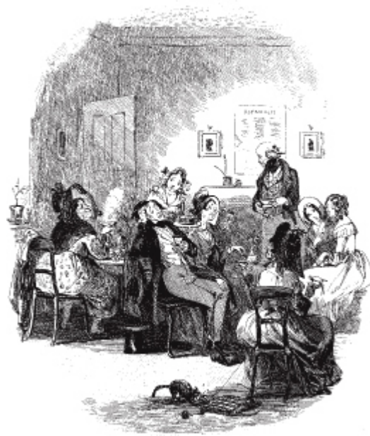
Mrs Gamp makes tea

At first he gazed angrily upon her, as upon a stranger who endeavoured to deceive him; but, peering into her face, and seeing that it was indeed she, he shook his head in sorrowful compassion.