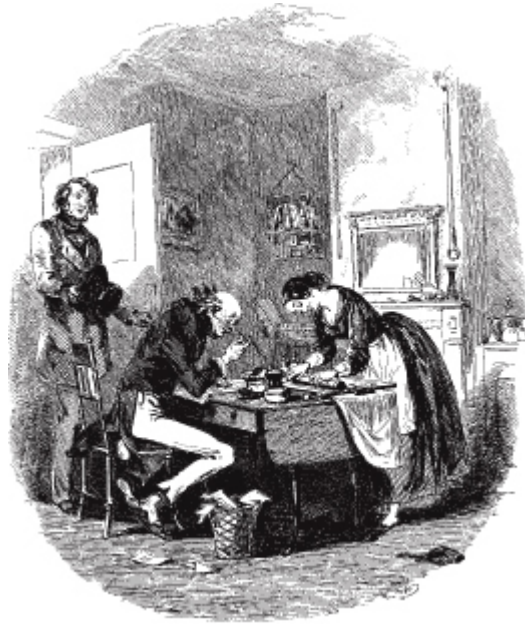
Mr Pinch and Ruth, unconscious of a visitor

John said, of course, that this was quite unnecessary, for he had been transfixed in silent admiration; and he held out his hand to Miss Pinch; who couldn't take it, however, by reason of the flour and paste upon her own. This, which might seem calculated to increase the general confusion and render matters worse, had in reality the best effect in the world, for neither of them could help laughing; and so they both found themselves on easy terms immediately.