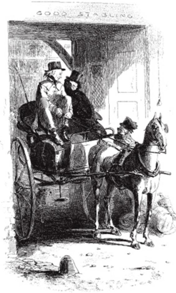
Pinch starts homeward with the new pupil

‘When I say nothing,’ observed Mr Pinch, cheerfully, ‘I am wrong, and don’t say what I mean, because I get a great deal of pleasure from it, and the means of passing some of the happiest hours I know. It led to something else the other day – but you will not care to hear about that, I dare say?’