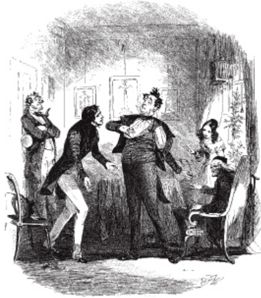
Mr Pecksniff announces himself as the shield of Virtue

'Pecksniff,' said the old man, in a feeble voice. 'Calm yourself. Be quiet.'