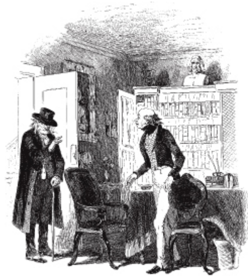
Mr Pinch is amazed by an unexpected apparition

He had by this time come up to Tom, and now he seized his hand.