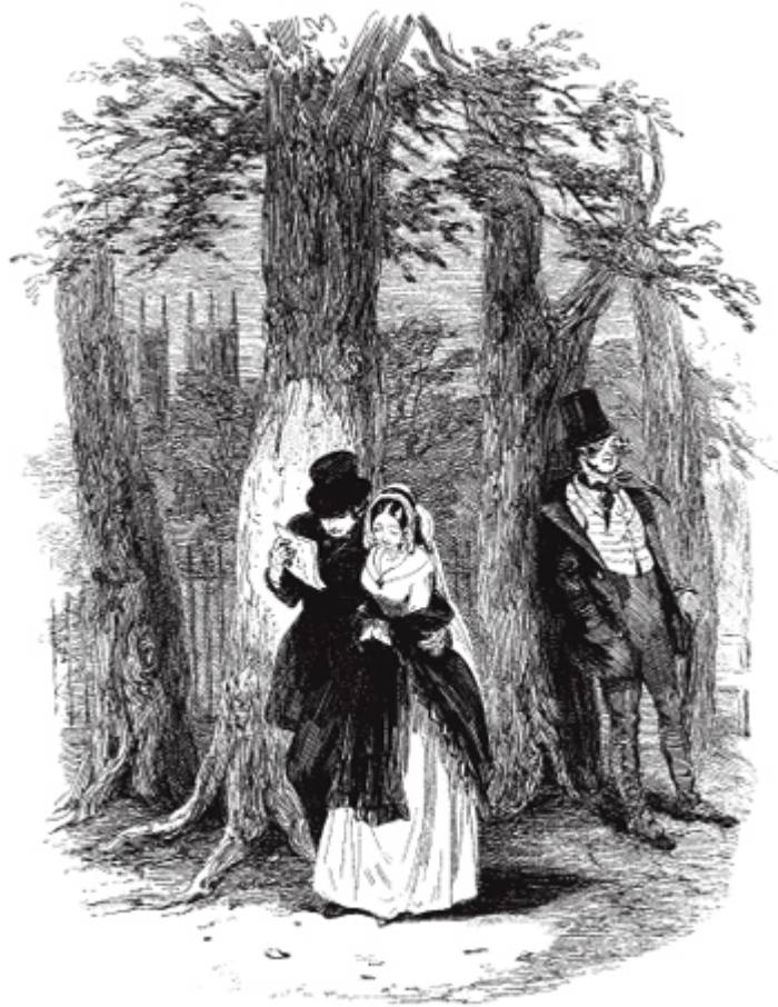
Mr Tapley acts Third Party with great discretion

‘What change is there in you , Martin,’ she replied; ‘for that concerns me nearest? You look more anxious and more thoughtful than you used.’