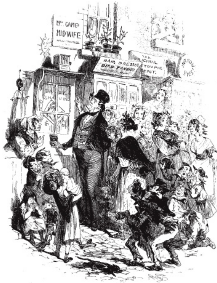
Mr Pecksniff on his Mission

‘So he ought to be, if he’s the feelings of a man,’ observed another.