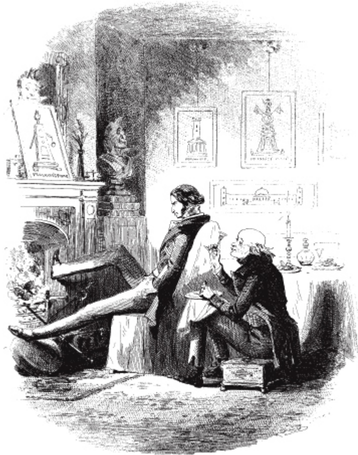
Mr Pinch and the new pupil on a social occasion

'You must know then, to make short of a long story,' said Martin, beginning with a kind of effort, as if the revelation were not agreeable to him: 'that I have been bred up from childhood with great expectations, and have always been taught to believe that I should be, one day, very rich. So I should have been, but for certain brief reasons which I am going to tell you, and which have led to my being disinherited.'