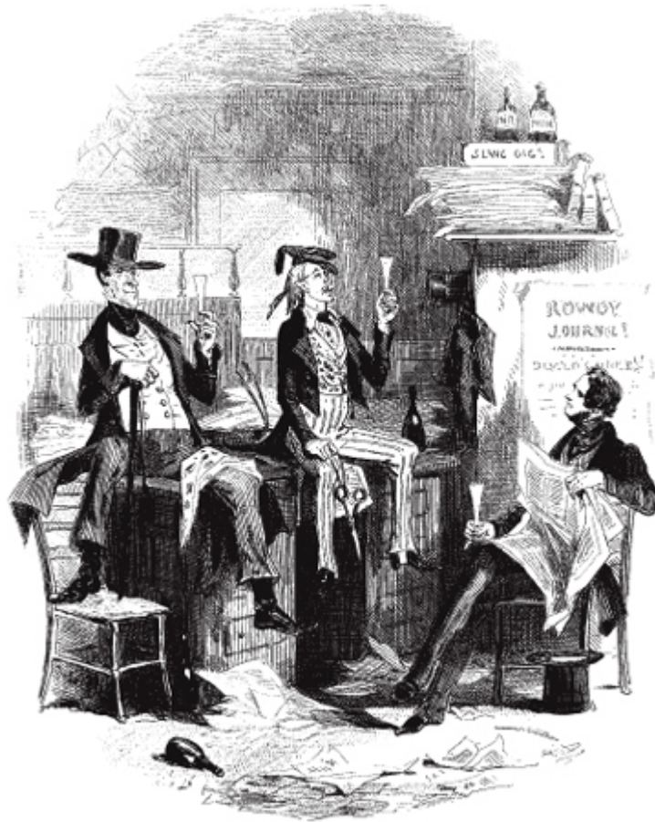
Mr Jefferson Brick proposes an appropriate sentiment

'Pray,' said Martin, after some hesitation, 'may I venture to ask, with reference to a case I observe in this paper of yours, whether the Popular Instructor often deals in – I am at a loss to express it without giving you offence – in forgery? In forged letters, for instance,' he pursued, for the colonel was perfectly calm and quite at his ease, 'solemnly purporting to have been written at recent periods by living men?'