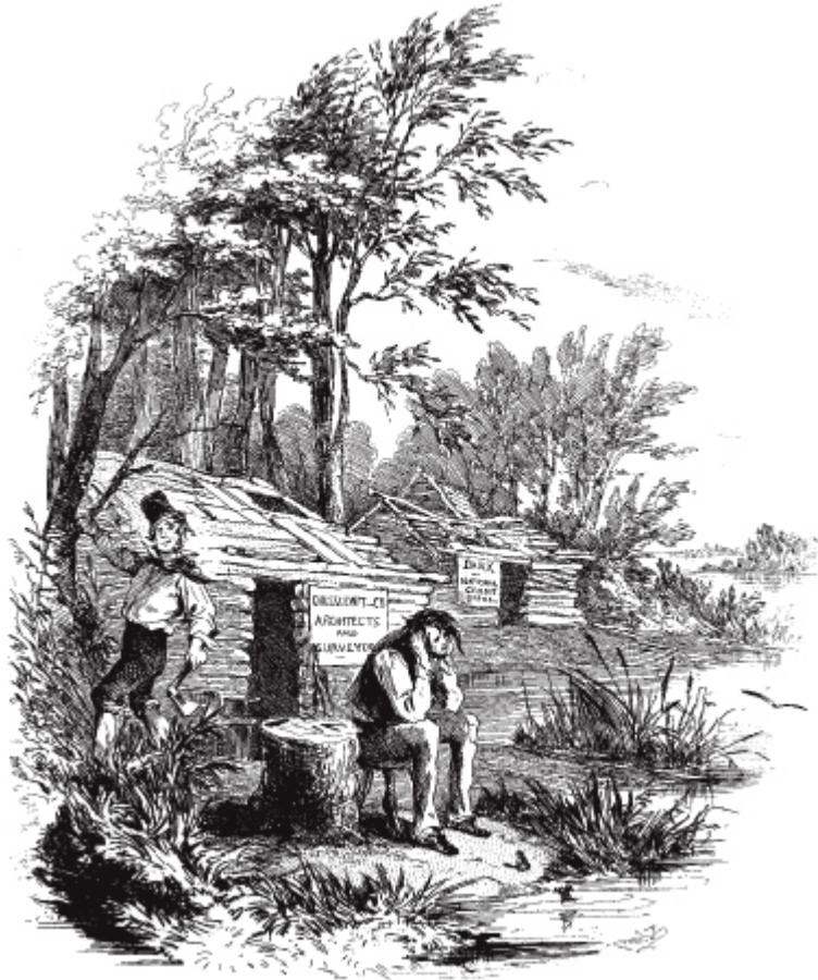
The thriving City of Eden, as it appeared in fact

'Why, sir,' returned Mark, 'for the matter of that, ev'rybody as is here might say the same thing; many of 'em with better reason p'raps than you or me. Hold up, sir. Do something. Couldn't you ease your mind, now, don't you think, by making some personal observations in a letter to Scadder?'