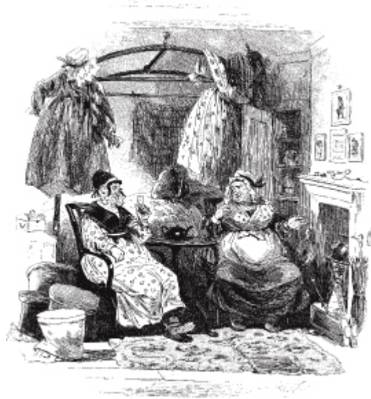
Mrs Gamp propoges a toast

‘You have heerd me mention, Betsey,’ Mrs Gamp replied, after glancing in an expressive and marked manner at the tea-pot, ‘a person as I took care on at the time as you and me was pardners off and on, in that there fever at the Bull?’