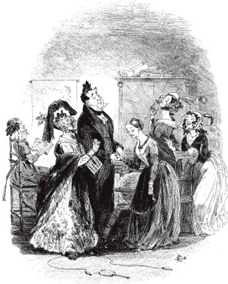
M. Todgers and the Pecksniffs, call upon Miss Pinch

'I know he has the will, sir,' said Tom Pinch's sister, 'and I know how kindly and considerately you cherish it, for which neither he nor I can ever be grateful enough, as we very often say in writing to each other. The young ladies too,' she added, glancing gratefully at his two daughters, 'I know how much we owe to them.'