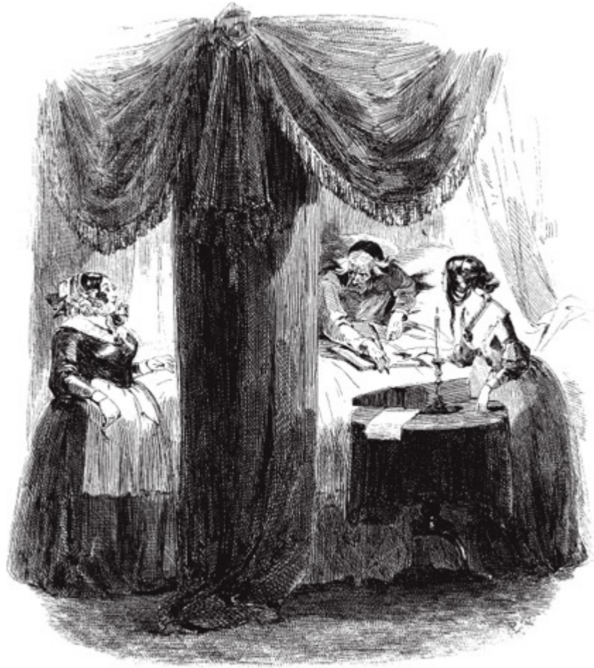
Martin Chuzzlewit suspects the landlady without any reason

‘Come,’ he said, ‘tell me who is it? Being here, it is not very hard for me to guess, you may suppose.’