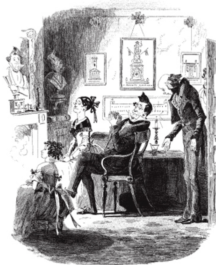
Meekness of Mr Pecksniff, and his charming daughters

'My loves!' said Mr Pecksniff, with the same serene upraising of his hand;