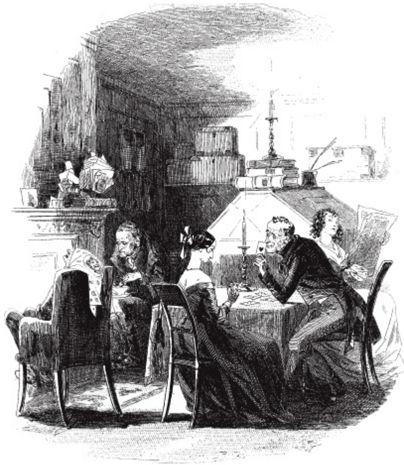
Mr Jonas Chuzzlewit entertains his cousins

‘Never, my dear Miss Pecksniffs,’ said Mrs Todgers, when they retired to rest on the last night of their stay; ‘never have I seen an establishment so perfectly broken-hearted as mine is at this present moment of time. I don’t believe the gentlemen will be the gentlemen they were, or anything like it – no, not for weeks to come. You have a great deal to answer for; both of you.’