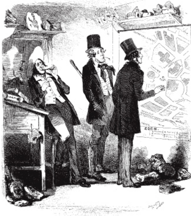
The thriving City of Eden, as it appeared on paper

'If I can realise your meaning, ride me on a rail!' returned the General, after pausing for consideration.