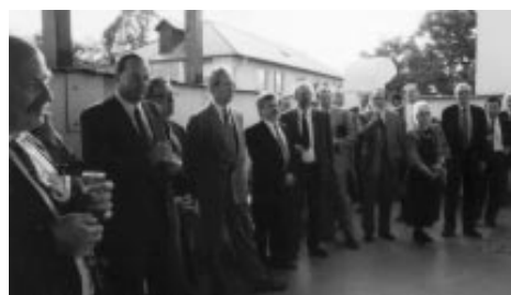
Gathering following opening