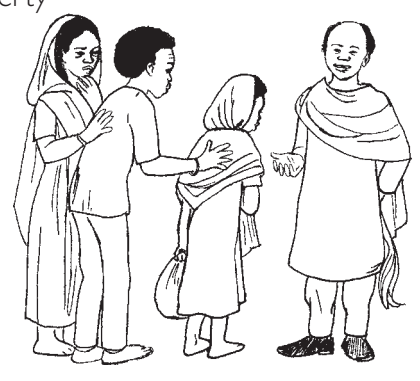
Some girls are married as children to make sure they will be virgins. This can cause serious health problems for a girl and her babies (see page 59).

But sexual desire is a natural part of life, and a woman can feel as much sexual desire and pleasure as a man.