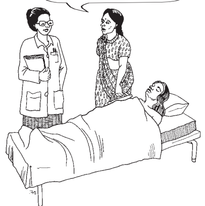
If a woman is very sick, someone who can give information should go with her.

I am her mother. I can answer some of your questions.