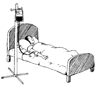
In places where blood is not tested for HIV, people can also get HIV from blood transfusions.

The HIV virus does not live in other body fluids such as sweat, tears, or saliva. It cannot live outside the body, in the air or in the water, for more than a few minutes.