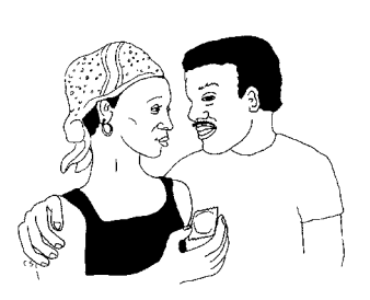
Using a condom every time you have sex helps protect you and your partner from HIV and other STIs.

Not using a condom increases your risk of getting other STIs. Having an STI increases your chances of getting HIV because they often cause open sores on the genitals. See pages 388 to 389 for information about preventing and treating STIs.