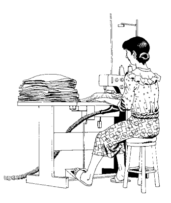
A local extractor removes the dust as it is created.

A dust mask can prevent some dust from going into your nose and mouth. But it will not protect you from chemical fumes or vapors in the air. See chapter 18: Personal protective equipment, for more information on dust masks and respirators.