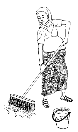
Cleaning should not add to the dust problem by stirring up the dust again.