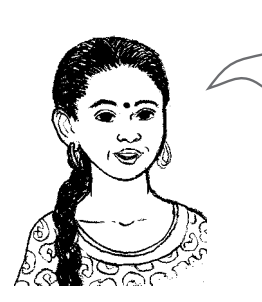
Telling a story or acting out a "role-play" or skit are good ways for groups to discuss complicated situations. Sometimes it is easier to discuss madeup problems than real ones.

Here is an example of a story and a discussion as well as ideas for other stories or role-plays.